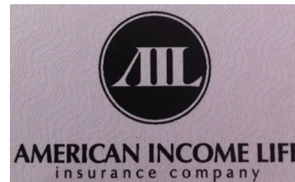
American Income Life Insurance Company